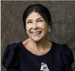
Alanis Obomsawin C.C., G.O.Q., C.A.L.Q.

A member of the Abenaki Nation and one of Canada's most distinguished artists, Alanis Obomsawin has been a trailblazing champion of Indigenous storytelling and cinema over a legendary career that began at the NFB in 1967.